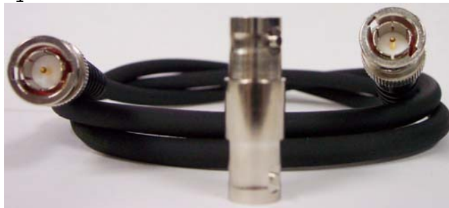
VTM Optional Cable Kit

The VTM Video Timing Meter and the VVM Video Volt Meter together make a complete test set for CCTV cameras. The VVM measures video sync and white Level , while the VTM measures relative timing of CCTV cameras. Both meters are manufactured by F M Systems, Inc. located at 3877 South Main Street in Santa Ana, California 92707 and can be reached by phone at 800-235-6960 or by FAX at 714-979-0913.