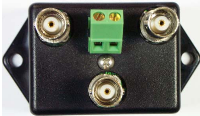
VIDEO A/B RELAY SWITCH